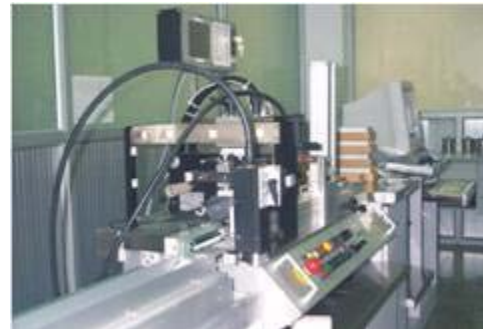
Ink Jet Printing