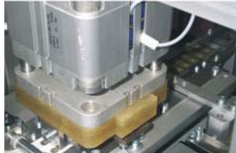
Card Milling Hole