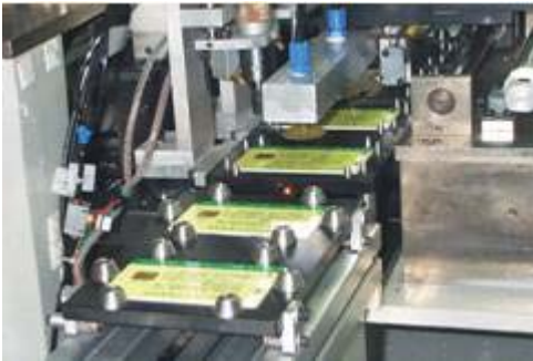
Card Production Line