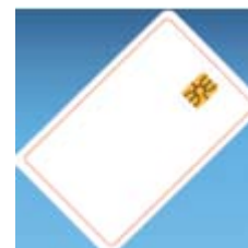
Contact & Contactless